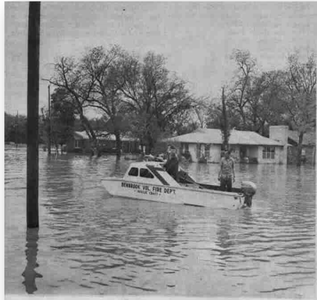
Figure 4: Benbrook Volunteer Fire Department Assisting Richland Hills Flood Victims, 1957

By 1940, the Benbrook community had grown to 100 people and three stores. Fort Worth donated land to the federal government that same year for the construction of a bomber plant to be operated by Consolidated Vultee Aircraft Company 96 (Convair; later renamed General Dynamics then Lockheed Martin). The plant began construction on April 18, 1941 and the first B-24 "Liberator" bomber rolled off the assembly line in April 1942. 97 The Tarrant Air Drome (later renamed Carswell Air Force Base in 1948) was established at the same time. Benbrook Estates subdivision (which includes Del Rio Avenue, Goliad Street, and San Angelo Avenue to Mercedes Street) was platted in 1946. Lots were typically 70 feet by 170 feet.