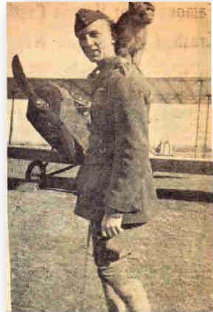
Figure 2: Vernon Castle

Early during World War I, General John J. "Blackjack" Pershing invited the Royal Canadian Flying Corps to establish its training fields in Texas because of its mild weather. After looking at sites in Dallas, Fort Worth, Waco, Austin, Wichita Falls and Midland, three sites were established in 1917 in the Fort Worth vicinity; one each in North Fort Worth, Everman and Benbrook (known as the 'Flying Triangle'). 64 The Royal Flying Corps used the fields from October 1917 to April 1918, when they were turned over to the U.S. Army. 65 Taliafero Field No. 3, later renamed Carruthers Field 66 (after Cadet W.K. Carruthers who was killed on June 18, 1917 67 ) was located south of Mercedes Street in what is now Benbrook Lakeside subdivision. Most of the 34 buildings and hangars 68 were located in an area generally bounded by Mercedes Street on the north, Winscott Road on the east, Cozby North Street on the south, and Walnut Creek on the west. A railroad spur connected with the Texas & Pacific line across Walnut Creek. When the U.S. entered the war, the field was renamed Benbrook Field and served to train American pilots as well.